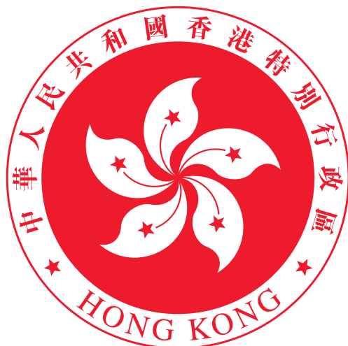
The Design of the Regional Emblem of the Hong Kong Special Administrative Region